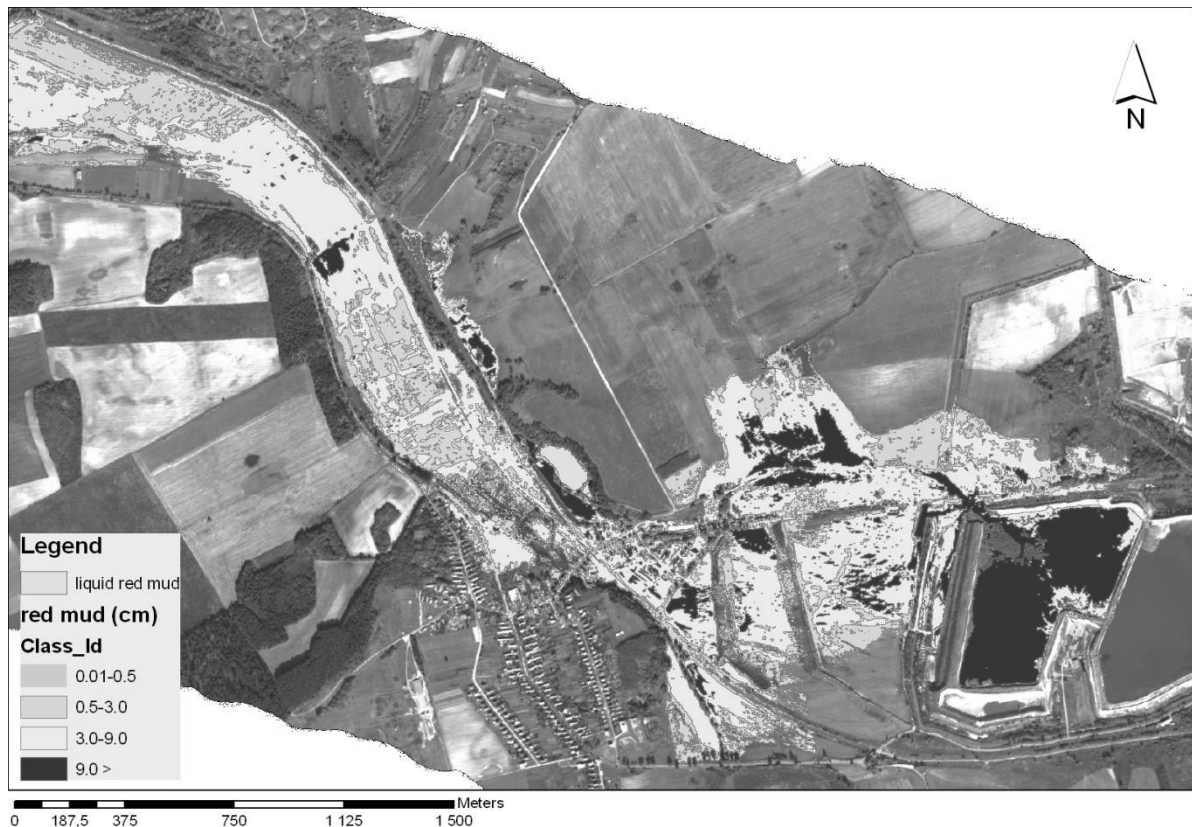
Figure 4. Hyperspectral mosaic (RGB) and areas covered by layers of different thickness

The volume between the two areas was defined by their intersection. The 'reconstruction' of the broken piece of wall was also made based on the shots above. We have also defined the cross-section and longitudinal section of the reservoir [4]. We applied different classes (end members) according to the surface cover. The wet phase, with dry matter content less than 30%, was defined separately. When applying the SAM, the angle value was optimized based on the control areas. After the area impoundment we defined the spectra correlating with the thickness of mud (in case of a mud with 30-70 percent by mass) with the help of regression analysis, based on on-the-spot samples. Based on the RMLI (Red Mud Layer Index) calculation from the 550 nm and the 682 nm band cassette we defined the threshold values for 4 thickness categories of previously marked areas (Figure 4.), [4].